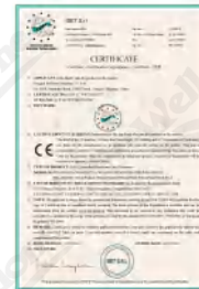
LPG DISPENSER CE