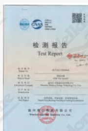
PQR TEST REPORT