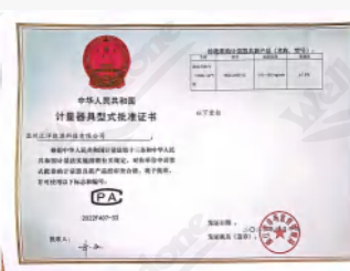
LNG DISPENSER PAC