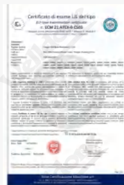
FUEL DISPENSER ATEX