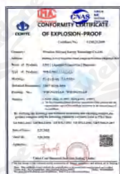
LNG DISPENSER EXPLOSION PROOF