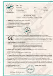
FUEL DISPENSER CE