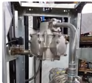
不锈钢尿素流量计 Stainless Steel Adblue Flowmeter