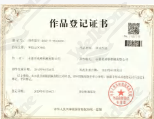
PATENT CERTIFICATES FOR MANAGEMENT SYSTEM