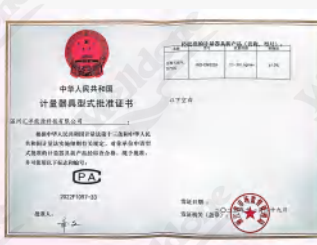
CNG DISPENSER PAC