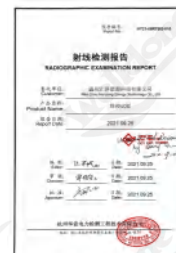
RADIOGRAPHIC EXAMINATION REPORT