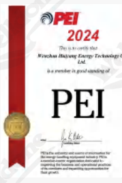
PEI MEMBER CERTIFICATE