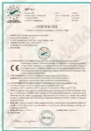
CNG DISPENSER CE