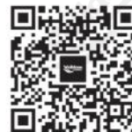
WeChat public account