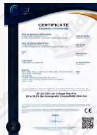
ABBLUE DISPENSER CE