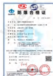
CNG DISPENSER EXPLOSION PROOF