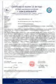
LNG DISPENSER ATEX