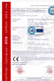
MOBILE GAS STATION CE