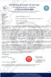
JUNCTION BOX ATEX