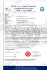
SUBMERSIBLE TURBINE PUMP ATEX