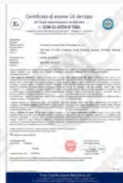
MOBILE GAS STATION ATEX