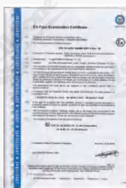
MASS METER ATEX