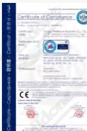
POSITIVE DISPLACEMENT METER CE