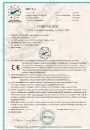
LNG DISPENSER CE