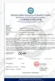
LNG DISPENSER PED